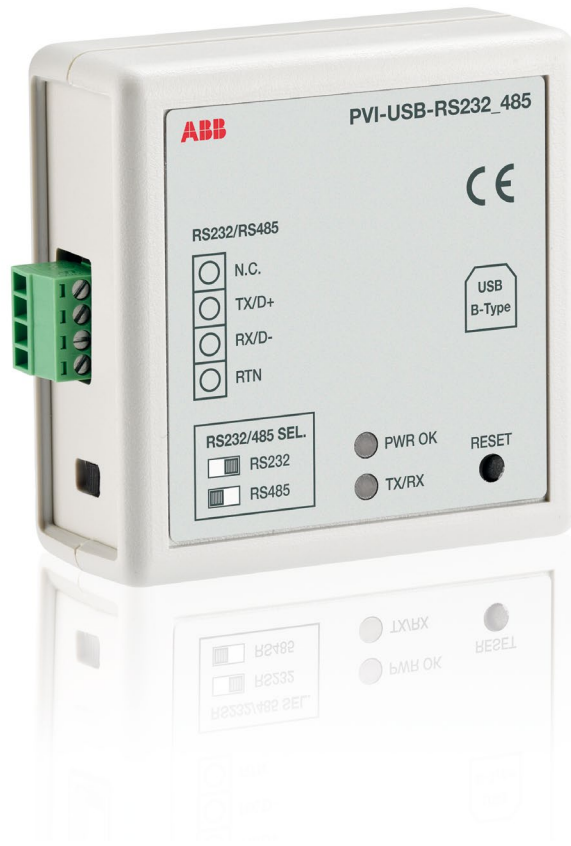
ABB monitoring and communications PVI-USB-RS232_485 Converter